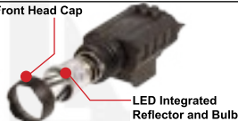
LED Integrated Reflector and Bulb