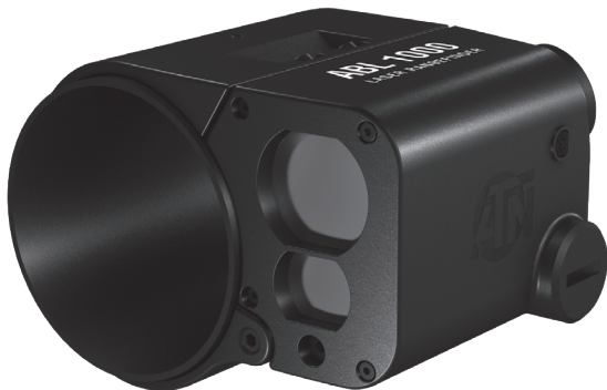
AUXILIARY BALLISTIC LASER (ABL 1000/1500)

Important Export Restrictions! Commodities, products, technologies and services contained in this manual are subject to one or more of the export control laws and regulations of the US BIS-Department of Commerce, Export Administration Regulations. It is unlawful and strictly prohibited to export, or attempt to export or otherwise transfer or sell any hardware or technical data or furnish any service to any foreign person, whether abroad or in the United States, for which a license or written approval of the U.S. Government is required, without first obtaining the required license or written approval from the Department of the U.S. Government having jurisdiction. Diversion contrary to U.S. law is prohibited.