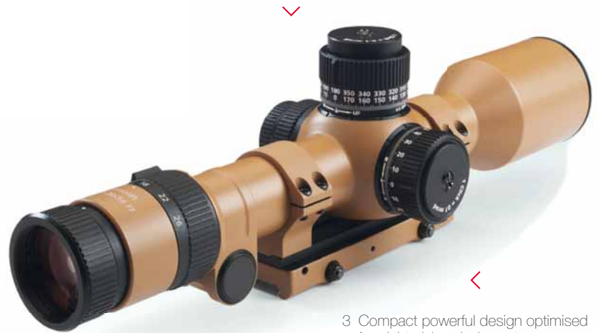
3 Compact powerful design optimised for night-vision devices. CR-123 powered reticle illumination for all temperatures