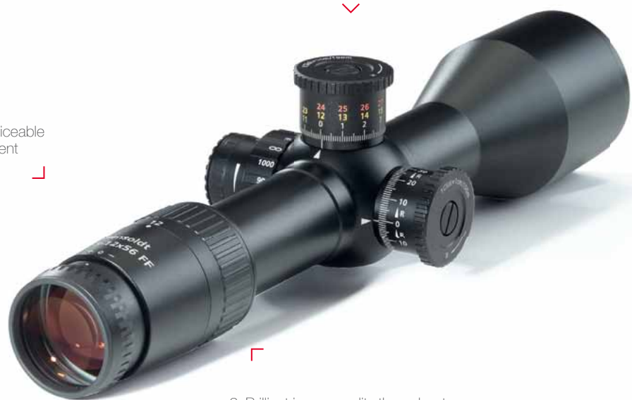
3 Brilliant image quality throughout the adjustment range