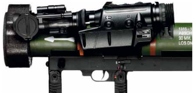
Hensoldt Fire Control System with Night Sight Device NSV 600