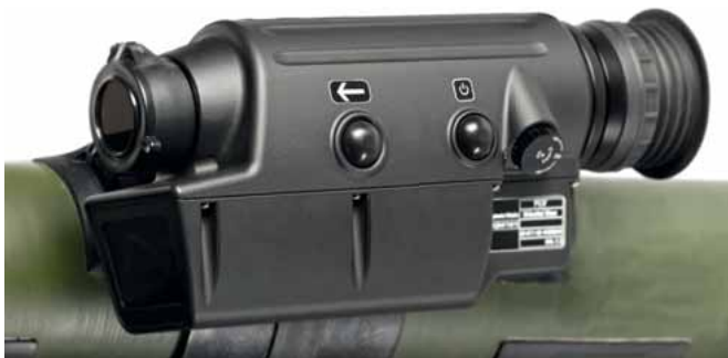
Hensoldt Fire Control System on Recoilless Grenade Weapon 90